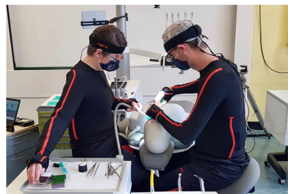
Fig. 2 Treatment of the phantom head when wearing the MVN Link system by Xsens. Subjects can move freely without interference with the measurement system

From the data of the biomechanical analysis, a risk score is determined for every recorded frame using the Rapid Upper Limb Assessment (RULA) [38]. On the basis of this mean score and SD for wrist and arm (Section A) and neck, trunk and leg (Section B) can be determined via RULA [38]. Furthermore, the percentage of time spent in the respective risk scores and at high risk should be determined. Both score values result in an overall score that indicates the level of MSD risk of the examined activity [38].