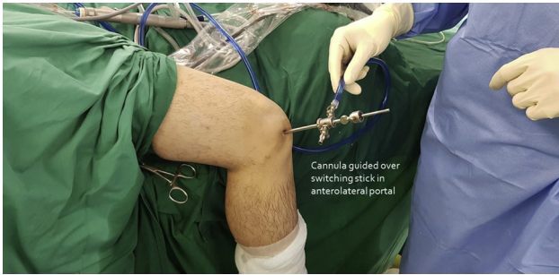
Fig 1. The trocar sleeve is introduced over the switching stick in the anterolateral portal of the right knee to enter the posterior compartment.

arthroscopic cannula with a blunt obturator instead. Kramer et al. 6 described this very technique, which involves the placement of a blunt obturator through the anterolateral portal. This is done blind, by palpating the nonarticular anterolateral wall of the medial femoral condyle and following the lateral border of the medial femoral condyle until there is a give through the interval between the posterior cruciate ligament and the medial femoral condyle. The obturator is then replaced with the arthroscope to achieve visualization of the posteromedial compartment. Ahn and Ha 7 also reported a similar technique passing a trocar together with its cannula through the transcondylar notch to the posteromedial compartment while feeling for its passage.