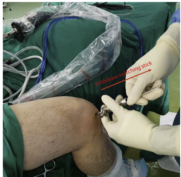
Fig 4. Right knee, the switching stick is removed from the anterolateral portal.

Because of the large diameter of the cannula that still can cause damage to the surrounding structures, we