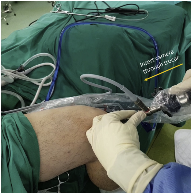
Fig 5. Right knee, the camera is inserted through the trocar in the anterolateral portal.

have developed another method for passing the arthroscope to the posterior compartment. Our simple technique involves using a long, cannulated switching stick (switching stick, 4.5 mm × 340 mm; Smith & Nephew, Andover, MA) with a narrower diameter than our trocar sleeve, passing it through the anterolateral portal between the lateral border of the medial femoral condyle and the medial border of the PCL. This is done under direct visualization with the arthroscope in the anteromedial portal. The switching stick, being tapered and narrow, is able to traverse the transcondylar notch with minimal trauma. Once the switching stick enters the posteromedial compartment, the camera and trocar are removed from the anteromedial portal and