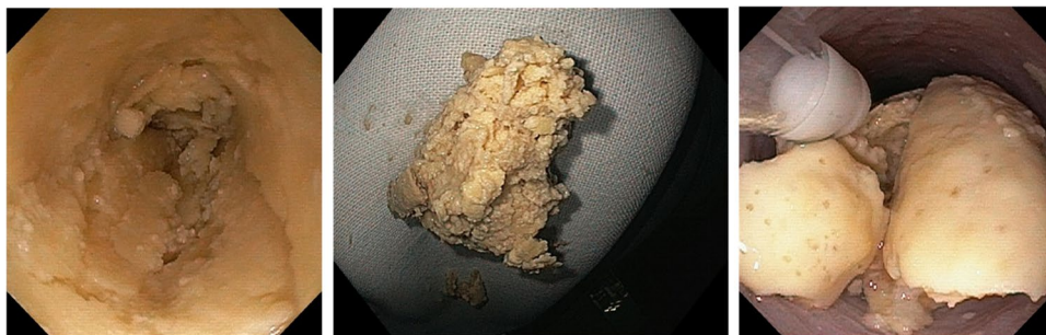
Fig. 1 Representative endoscopic images of solidified enteric nutrition. A Completely occluded esophageal lumen. B Piece of a bezoar after incomplete extraction attempted with a net. C Endoscopic placement of a nasogastric tube (11 o'clock) just proximal to the bezoar