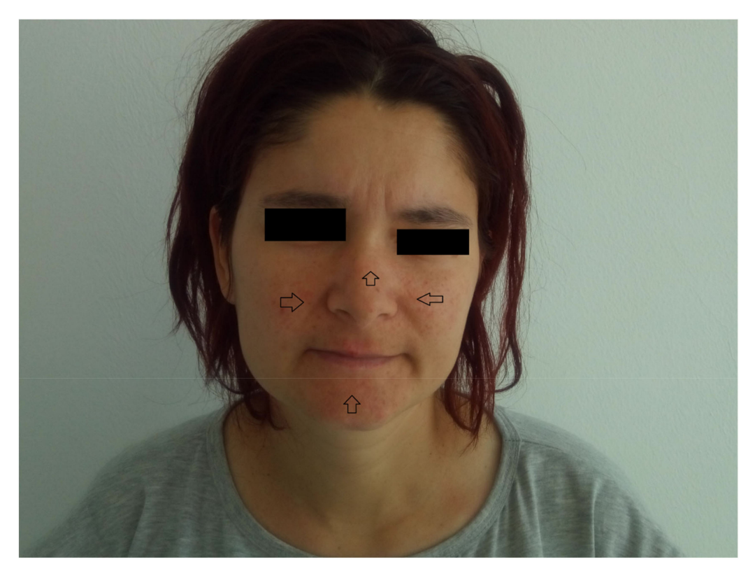
Figure 1. Facial angiofibromas on the nasal wings, cheek and chin.

The findings of the physical examination were: normal body build, pale skin and mucosae, facial angiofibromas on the nasal wings, cheek and chin (Figure 1), hypopigmented plaques on the lower limbs (Figure 2), confetti-like lesions on the legs (Figure 3), small shagreen spots on the posterior hemithorax (Figure 4), tachycardia, painful abdomen and highly sensitive left flank, left costovertebral angle tenderness, pollakiuria. Due to the presence of typical skin lesions TSC diagnosis was suspected.