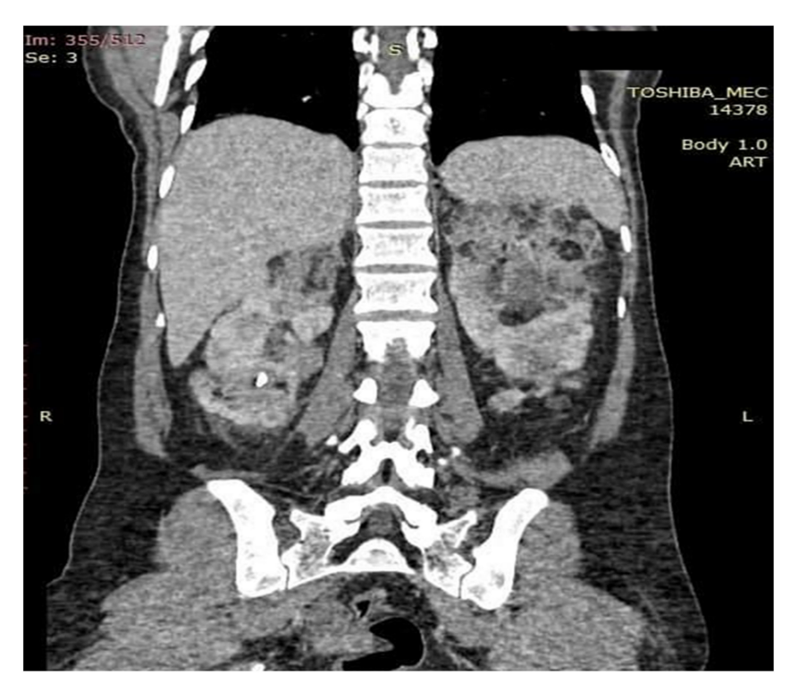
Figure 6. CT aspect of kidney modifications. Sagital CT section with contrast substance.