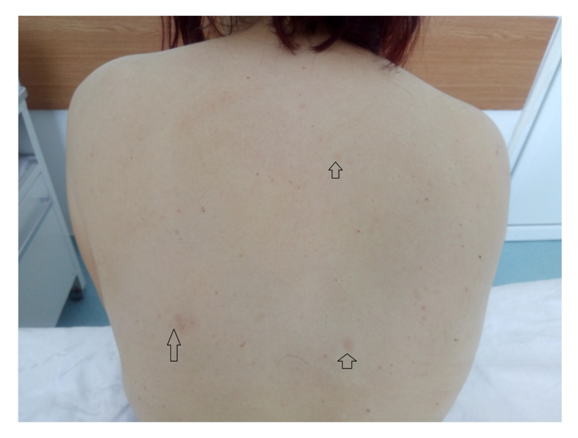
Figure 4. Small shagreen spots on the posterior hemithorax.

Neurological examinations showed reduced osteotendinous reflexes (bicipital and patellar), without other pathologic findings. The ultrasound examination showed liver with nonhomogeneous echo pattern, steatosis, possible homogeneous hyperechoic hemangiomas. Kidneys appeared with irregular contours difficult to delimit from the surrounding tissues, very much modified structure with multiple, well delimited nodular images with mixed structure, consistent with ultrasound findings of angiomyolipomas and mild pyelocaliceal dilatation, both suggestive of bilateral obstructive lithiasis, complicated by uretero-hydronephrosis. The echocardiography examination showed aortic aneurysm and ECG showed sinus arrhythmia.