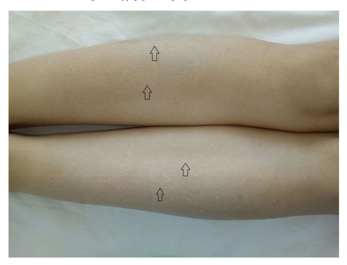
Figure 3. Confetti-like lesions on the legs.