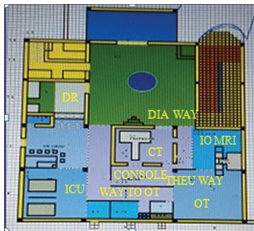
Figure 1: Setup of intraoperative magnetic resonance imaging, operation theater, computed tomography scan, and Intensive Care Unit

General anesthesia was given at P3 level, and skin marking was given with the help of MRI contrast guidance. Craniotomy flap or the laminectomy was done, and the dura opened in the similar fashion by the same instruments as for the nonIMRI case. Rubber bands made from the gloves were used, where ever retraction was needed and stitched to draping. Corticectomy is planned after the T1 contrast image to localize and minimize the cortical resection. From P3 to P1 and vice versa, the patient was taken in multiple session to excise the tumor to around 0.5 mm of margin for radiotherapy [1] according to T1 contrast axial, coronal, and sagittal views, so that the resection is optimized and maximized. Immediate preclosure hematoma and edemas can be differentiated and cared for it.