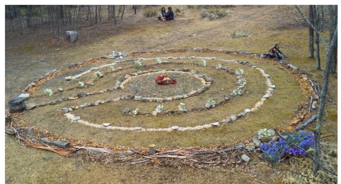
Fig. 1. Labyrinth at Fractangular Gathering. Source: Author 1, permission granted by participant.

Since 2013 ... every summer [our site] just got drier and drier and drier. And I remember seeing these marshy areas when we first arrived ... But the summers were getting—those boggy spots were getting drier and drier and 2020 was the driest year of all. There was no creek. There was just a stagnant puddle. The grass was—it was