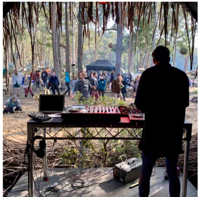
Fig. 2. Performance at Tasmanian bush doof.