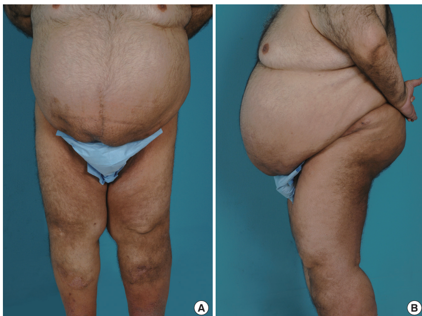
Fig. 3. (A, B) Three-month postoperative images showing no evidence of recurrence.

of MLL in the future. In this report, a rare case of MLL was successfully treated by surgical resection. Although there were minor complications such as wound dehiscence and seroma, there were no major complications or recurrence for a period of three months after surgery.