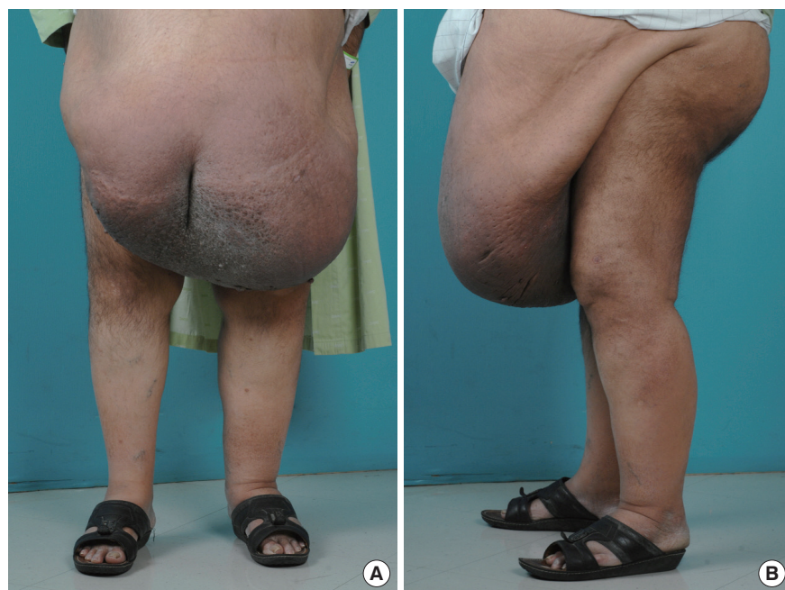
Fig. 1. (A, B) Preoperative photograph of a 54-year-old male with massive localized lymphedema at the abdomen.

A 54-year-old morbidly obese male was admitted to our hospital with a giant mass involving the lower abdomen and mons pubis. The mass had started in the abdominal area and gradually increased in size over six years and later obscured his penis and scrotum (Fig. 1). The patient's medical history included morbid obesity, hypertension, diabetes, gout, and a renal stone. There was no history of trauma or surgery in the abdominal area. On physical examination, the patient was morbidly obese, with a weight of 130 kg, a height of 165 cm, and a body mass index of 47.75 kg/m 2 . The mass extended to the left knee when the patient stood at his full height. The skin overlying the mass had a 'peau d'orange' appearance. A CT scan of the patient showed skin and subcutaneous tissue thickening suggestive of lymphedema and a 3.3 cm-diameter umbilical mesenteric fat hernia. We decided to combine abdominoplasty with liposuction and repair the abdominal wall. The incision line was designated along the bottom line of the mass lesion and the umbilicus. After the skin incision, dissection was performed down to the level of the rectus fascia, and further to the intersecting boundary of the xiphoid process and bilateral costal margins. This wide undermining allowed the greatest amount of inferior advancement of the abdominal flap (Fig. 2A). Once the abdominal flap was elevated, tumescent solution (normal saline 500 mL+2% lidocaine 12.5 mL+0.1%