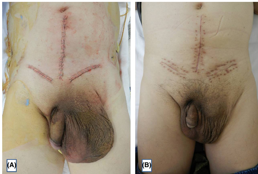
Figure 4. Photographs taken immediately (A) and 1 month (B) after surgery.

Concerning loss of domain, various methods for combatting this issue based on the debulking of the abdominal contents and the progressive distention of the abdominal wall have been described.