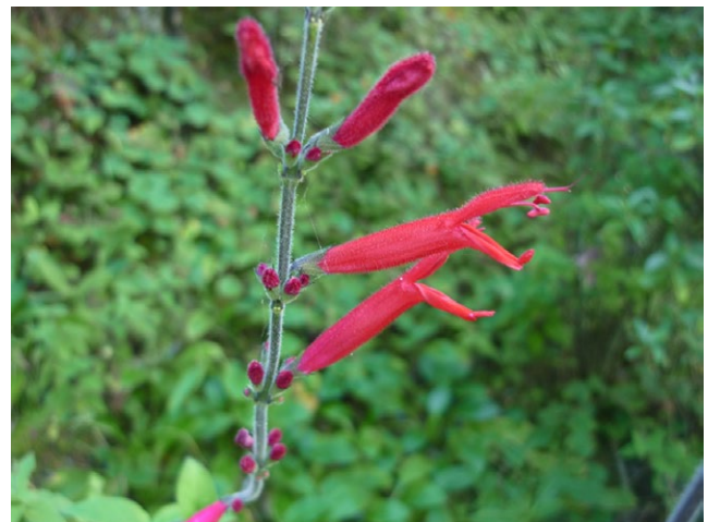
FIGURE 1 The tubular red flowers of Salvia elegans , showing the exerted stigma and the two stamens

The study was carried out at the protected natural area of “Cerro Garnica” with an extent of 968 ha located 50 km east of Morelia city, in the state of Michoacan, Mexico. The Cerro Garnica reserve (19°40'04"N; 100°49'36"W) belongs to the Trans-Mexican Volcanic Belt and has an average altitude of 2,950 masl and a temperate sub-humid climate (mean annual temperature 12–14°C and annual rainfall