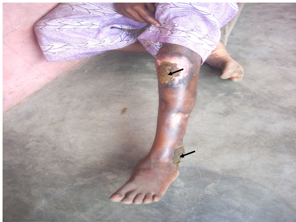
Figure 2 Herbal treatment for ulcers*.

*Respondent has had BU for more than 3 years and is being treated at home by his grandfather, a herbalist. Respondent's current condition is from recurring BU infections. The green patches (arrowed) are herbal dressings. Note the multiple scarring.