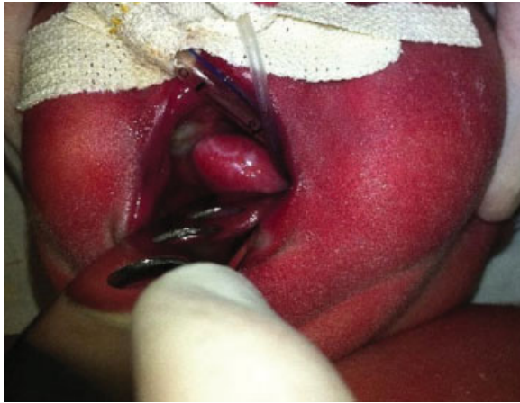
Fig. 1 Transoral view of the lesion.