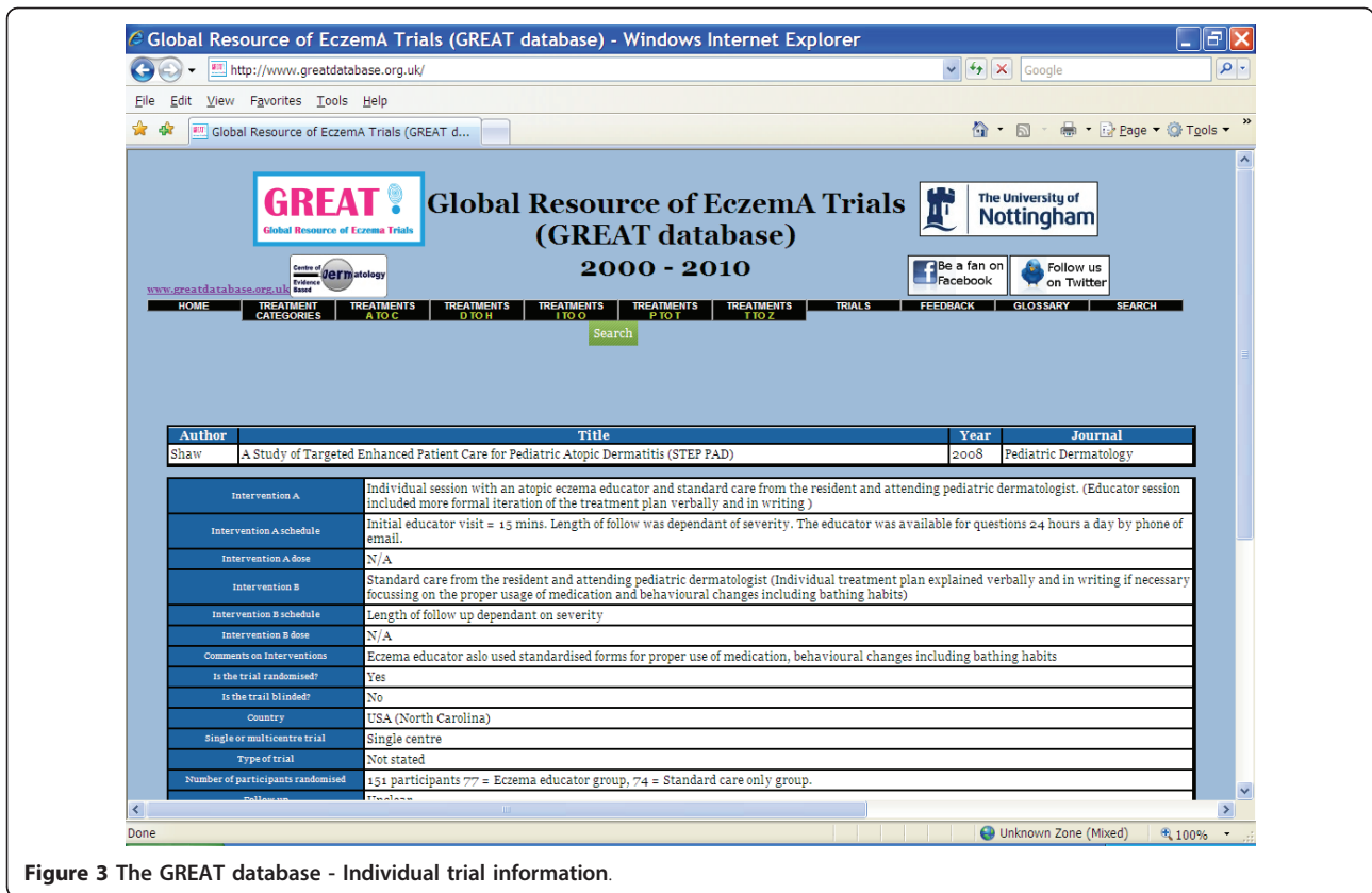
Figure 3 The GREAT database - Individual trial information.

would be required to be sure to obtain a specific and fully comprehensive list of only eczema trials from the Clinical Trials database.