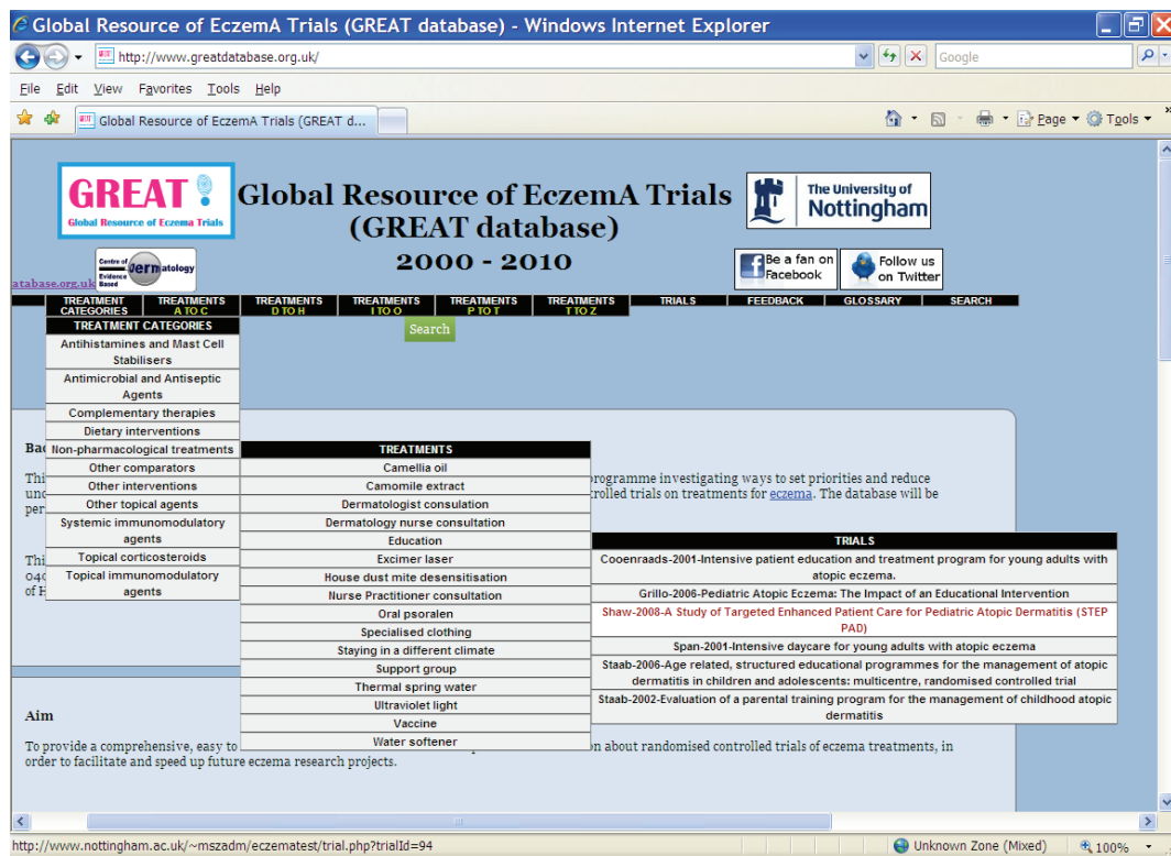
Figure 1 The GREAT database hierarchy is available on drop down menus.