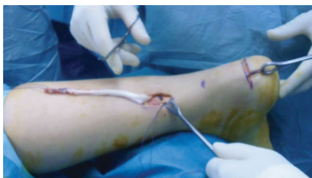
Fig. 3 The semitendinosus is passed under the skin bridge to the distal incision.

All patients were reviewed at the average follow-up of 27.9 months (range: 24–34 months) from surgery; no patient was lost to follow-up. Clinical results are reported in ► Table 1 .