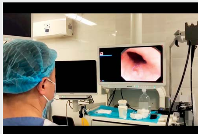
► Video 1 The artificial intelligence system is used to detect and delineate early esophageal squamous cell carcinoma in a real-life setting.