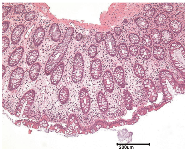
Figure 2. Muscularis mucosae in pneumatosis cystoides coli from the ascending colon.