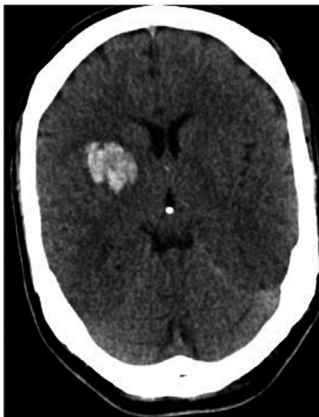
FIGURE 1 Brain CT scan showed a SICH by a 45-year-old patient, firstly diagnosed with blood hypertension. The patient was presented with a weakness on the left side and hypertensive crisis

The present study was part of the Stroke Registry at the Department of Neurology. The study (Stroke Registry) was approved by the local ethics committee.