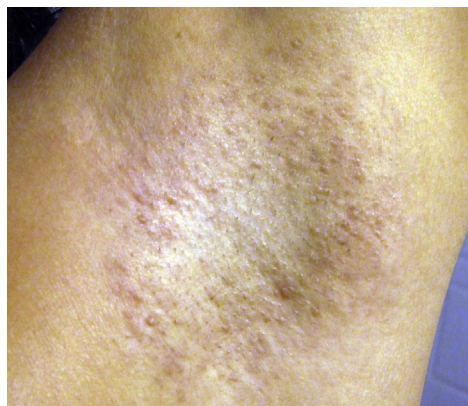
Fig 1. Diffuse red-brown 2- to 3-mm firm papules within the axillary vault.