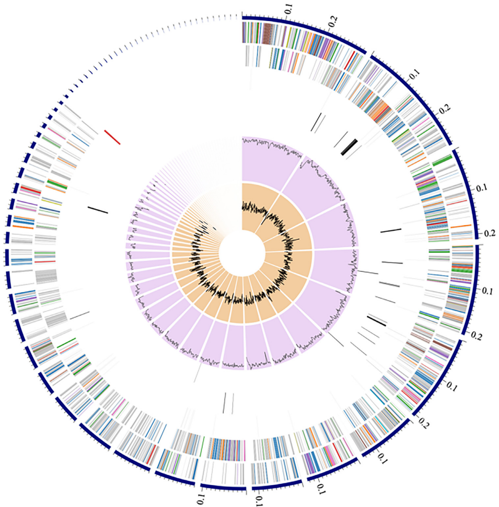
Fig. 1. The distribution of annotated genomic features. This includes, from outer to inner rings, the contigs, CDS on the forward strand, CDS on the reverse strand, RNA genes, CDS with homology to know antimicrobial resistance genes, CDS with homology to known virulence factors, GC content and GC skew.