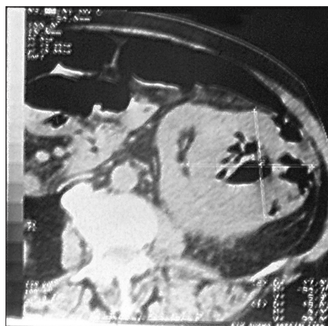
Figure 1: Renal CT scan reveals a large, heterogeneous left renal tumor with central gas formation

had a highly suspicious mass; arteriography was performed to confirm the diagnosis [Figure 2]. After the initial therapy he underwent radical nephrectomy. Five patients had a collection of pus that was drained by open surgical drainage [Figure 3].