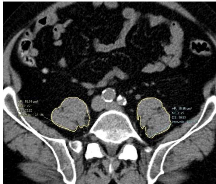
Figure 1. Axial non-enhanced CT scan showing polygonal manual segmentation (yellow outline of bilateral psoas muscles). The right psoas muscle area is 1574 mm 2 , and the left psoas muscle area is 1595 mm 2 . The PMD is 27 HU on both sides.

Finally, the total number of lumbar arteries was calculated before and after EVAR.