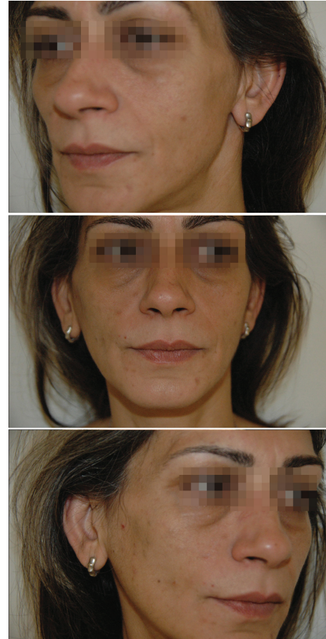
FIGURE 5: 42 year-old woman 3 years after a superficial parotidectomy for a benign tumor of the parotid gland with immediate reconstruction by an autologous fat graft (13 mL). After that procedure, the result remained very good on the aesthetic point of view until a weight loss of 17 kg leading to a partial atrophy of the fat graft and to a clinical preauricular defect. There is no Frey's syndrome as objectivated by a Minor's starch-iodine test.