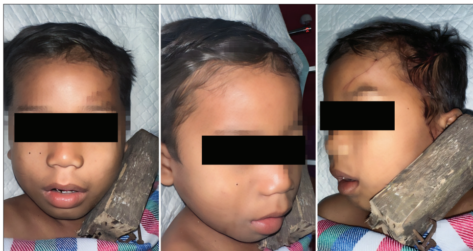
Figure 1: Clinical image capturing the entry point and trajectory of a foreign nail object in the left mastoid area of a 7-year-old patient. The photograph serves to highlight the specific characteristics and location of the penetrating object.

PBI in children poses significant clinical challenges. This condition occurs when an object penetrates through the