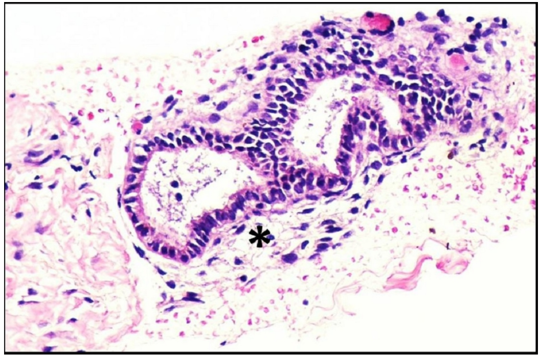
FIGURE 3: Pathology

Core biopsy reveals the characteristic findings of endometrial glands surrounded by stroma (exemplified by the asterisk). Hematoxylin and eosin stain; magnification x200