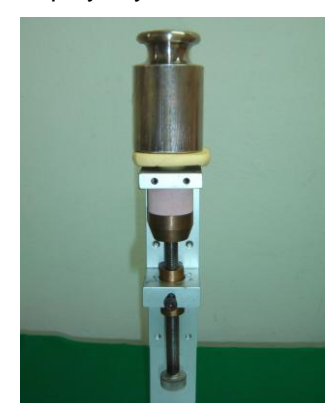
Figure 2: Load application during bonding

Specimens were allowed to set under a constant load of 1 kg for 15 minutes using a polyvinylsiloxane (Express putty, 3M ESPE, St. Paul, MN, USA) putty mould that was placed over the brass split mould and held in place by the weight (Figure 2). The 1 kg load was removed, and the samples were allowed to sit at room temperature for an additional 30 minutes with the polyvinylsiloxane mould still in place.