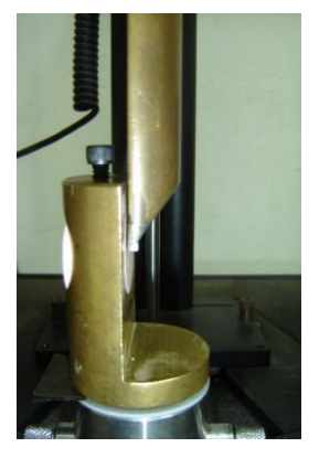
Figure 3: Specimen during shear bond strength testing

The bonded specimens were mounted in the shear test jig recommended by ISO [15] and tested using a universal testing machine (Instron® Corp., England) at a crosshead speed of 1 mm/min (Figure 3).