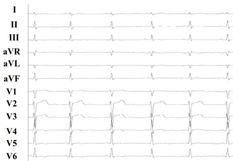
Figure 1A: Baseline ECG showing aspecific repolarization abnormalities in the infero-lateral leads.

for a 24 hour Holter ECG registration. In the afternoon following the exercise testing, during a small effort, the patient experienced cardiac arrest. In the emergency room, he was found to be in ventricular fibrillation. Four DC shocks and iv adrenaline and cardio-pulmonary reanimation maneuvers obtained restoration of vital signs and sinus rhythm. The ECG after resuscitation showed non-specific abnormalities of the repolarization in the infero-lateral leads ( Figure 1A ). The patient had full recovery from the neurological point of view. Cardiac magnetic resonance showed late-enhancement of the left ventricular apex associated with dyskinesia in the same region and of the antero-septal portion of the same ventricle. Coronary angiography and coronary computed tomography didn't reveal any coronary artery abnormalities or critical stenosis. Echocardiographic evaluation demonstrated a left ventricular ejection fraction of 40% and confirmed the cardiac magnetic resonance findings. Final diagnosis was resuscitated cardiac arrest in a patient with left ventricular apical aneurysm of unknown origin (ischemic vs congenital). The patient finally underwent implantation of a defibrillator (ICD).