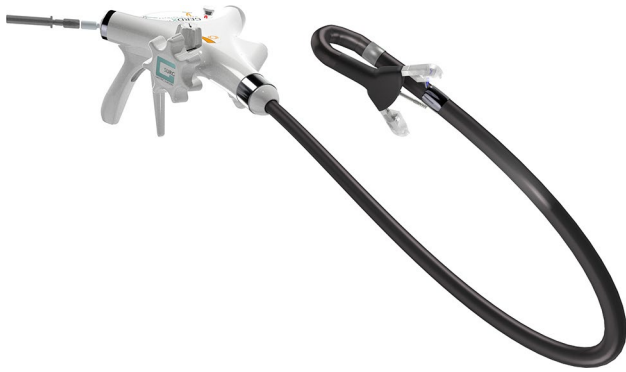
Fig. 2 GERDx™ (G-SURG GmbH, Seeon-Seebruck, Germany)

similar safety in application compared to the NDO Plicator [5].