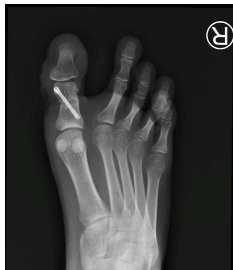
Figure 4 Post operative result depicting 8.93° interphalangeal joint angle.

This case report was registered and approved by the institutional review board of Hasan Sadikin Hospital, Bandung, Indonesia, No. LB.02.02/X.6.5/479/2022. The patient provided informed consent to publish their case details and any accompanying images.