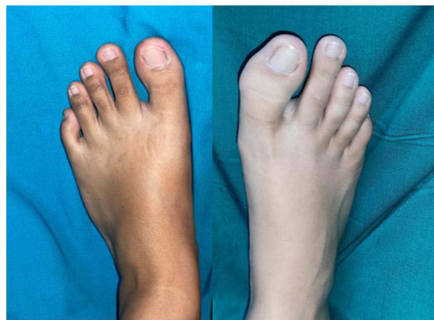
Figure 1 Hallux valgus interphalangeal deformity.

Surgical correction was done using Akin osteotomy and ossicle excision (Figure 3). The patient was operated under regional anesthesia in the supine position. Longitudinal incision was made on the medial side, deepened through the joint capsule to expose the osteotomy site. The guide wire was placed under an image intensifier visualization prior to the osteotomy. Medial closing wedge osteotomy was performed and fixed by a 3.2-mm diameter headless dual compression cannulated screw (Normed Medizin-Technik GmbH, Germany). After osteotomy, the ossicle and covering bursa at the lateral side was removed. Lateral capsule release and medial capsule imbrication were subsequently performed. Post-operative standard dressing was applied with particular spacing between the great toe and second toe. The patient was allowed to partially bear weight using a post-operative rocker bottom footwear. The post-operative interphalangeal joint angle was 8.93^\circ (Figure 4). The surgical wound healed uneventfully.