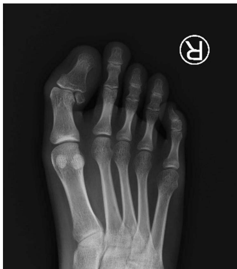
Figure 2 Lateral deviation of great toe interphalangeal joint as much as 28.69^\circ with the presence of an ossicle in lateral side.