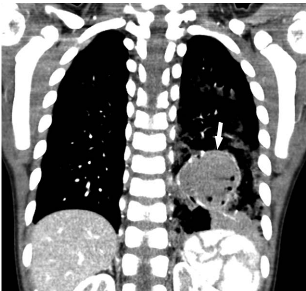
Figure 1. Contrast-enhanced chest computed tomography (CT). A 4.5 cm × 3.4 cm sized cystic pulmonary airway malformation is seen in left lower lobe (arrow).

Upon arrival in the operating room, three-lead electrocardiography, pulse oximetry (SpO 2 ), and non-invasive blood pressure were monitored. The baseline blood pressure and heart rate were 99/66 mm Hg and 112 beats per minute, respectively. Anesthesia was induced with 5 mg/kg thiopental and 1 mcg/kg remifentanyl. Rocuronium 0.5mg/kg served as the neuromuscular blocker.