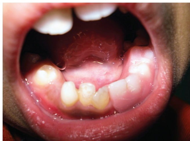
Fig. 9: Posttreatment photograph showing corrected anterior teeth with a removable partial denture

described two children who had very small cheek bones and notches in their lower eyelids. Therefore, the condition gets its name from him. For unaffected parents with one child with TCS, the chance of giving birth to a second child with the condition is negligible. Adults with TCS have a 50% chance of passing the condition to the offspring. When a parent with TCS passes on the genes, the children may be affected in varying degrees. The degree may be the same as the parent, milder or more severe. There are two possible ways that TCS develops. First, TCS can develop as a new mutation. This means that both parents pass on normal genes to their child. The second way that TCS develops is by inheriting it from one of the parents. 2 The only gene currently known to be associated with TCS is TCOF1 which is mapped to chromosome 5 q31.3-q33.3, encoding a serine/alanine-rich protein, called 'treacle'. 3 There is no preference among genders or races and it consists of autosomal dominant trait of variable expressiveness. Its phenotypical expression probably results from bilateral congenital malformation involving the first and second brachial arches. 4,5