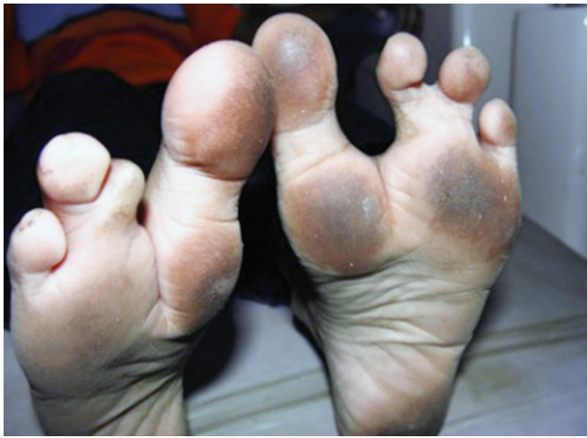
Fig. 2: Webbing of toes