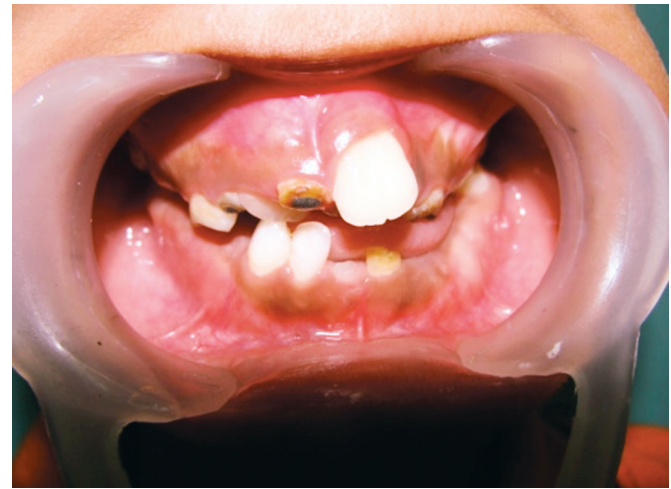
Fig. 4: Intraoral photograph showing retained deciduous teeth, missing permanent teeth and anterior crowding