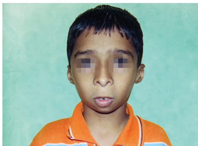
Fig. 1: Frontal view of the patient: Clinical signs

Treacher Collins syndrome (TCS), also called Treacher Collins-Franceschetti syndrome or mandibulofacial dysostosis, is an autosomal dominant disorder affecting the development of structures derived from the first and second brachial arches during early embryonic development. 1 The estimated incidence of TCS ranges from 1:40,000 to 1:70,000 of live births. TCS is characterized by deafness, hypoplasia of facial bones (mandible, maxilla and cheek bone), antimongoloid slant of palpebral fissures, coloboma of the lower lid and bilateral anomalies of auricle. It is a condition in which the cheek bones and jawbones are underdeveloped. 2