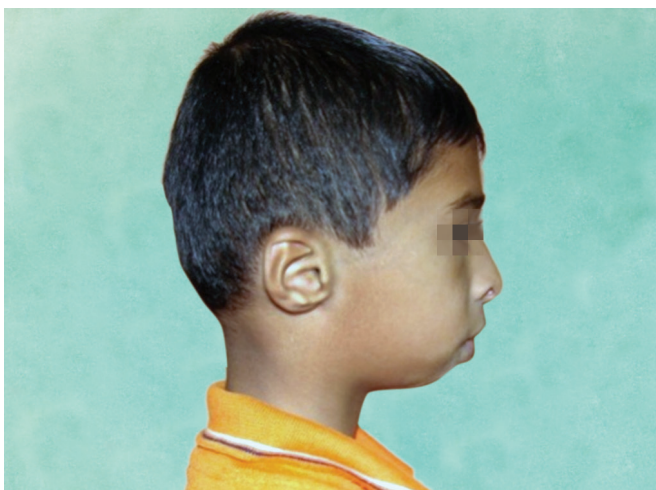
Fig. 3: Lateral view of the patient (profile): Clinical signs