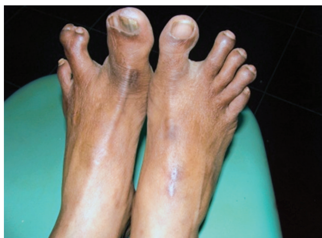
Fig. 8: Webbing of fingers and toes of the mother