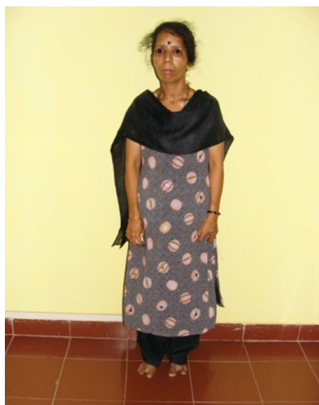
Fig. 7: Mother of the child