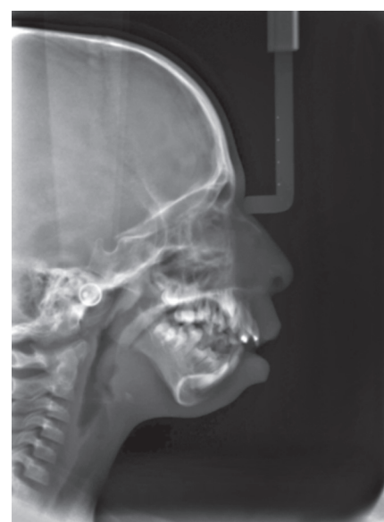
Fig. 6: Lateral cephalogram showing prominent antegonial notch and underdeveloped zygoma

The clinical condition demanded the need for removal of retained root stumps of deciduous teeth, restorations and root canal treatment followed by an artificial prosthesis for mastication till the eruption of the permanent teeth. Before starting the treatment we consulted a pediatrician, ENT