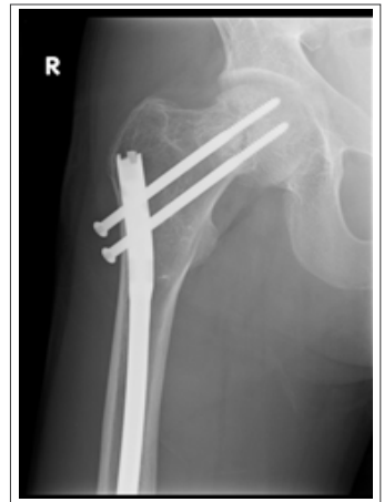
Figure 4: Left hip radiograph 1-year from time of injury

femoral shaft fractures treated with intramedullary fixation in 2011 (8 mm Orthopedic Nails) and a proximal tibial fracture, treated conservatively with a sarmiento cast in 2012.