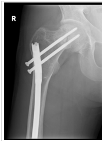
Figure 3: Right hip radiograph 1-year from time of injury