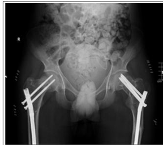
Figure 2: Immediate post-operative radiograph.