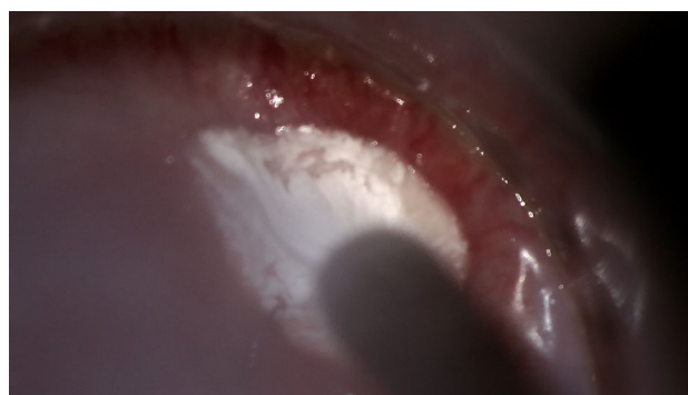
Fig. 2 Intra-anal high-grade squamous intraepithelial lesion post-cryotherapy treatment

Patients scheduled for cryotherapy at the Academic Medical Center (Amsterdam, the Netherlands) between 30 December 2008 and 23 April 2015 attended a maximum of five treatment visits, each visit 4–6 weeks apart. Treatment for intra- and perianal lesions consisted of office-based HRA-guided liquid nitrogen application in three freeze–thaw cycles using a spray gun with a standard 0.56 mm aperture, spraying 10 s per lesion (Fig. 2). At each treatment visit, self-reported side effects were noted and inquiries were made regarding blood loss and pain that may have resulted from the previous treatment, followed by inspection with HRA and guided cryotherapy for remaining HSIL lesions. If no lesions were seen, treatment response was defined as a complete response