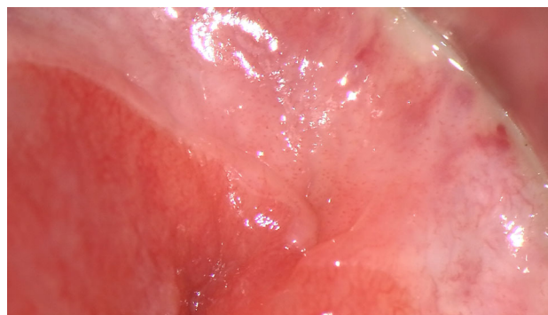
Fig. 1 Intra-anal high-grade squamous intraepithelial lesion pre-cryotherapy treatment

We studied HIV-positive MSM aged \geq 30 years who underwent AIN screening with HRA and were diagnosed with intra- and/or perianal HSIL, as described by Richel et al. [17] (Fig. 1). In short, screening was performed by one of three expert anoscopists (having performed more than 200 HRAs each) and consisted of a digital rectal exam followed by peri- and intra-anal inspection with a colposcope (ZEISS opmi pico surgical microscope) after repeated application of acetic acid (3% solution) and staining with Lugol's iodine when indicated. All lesions suspicious