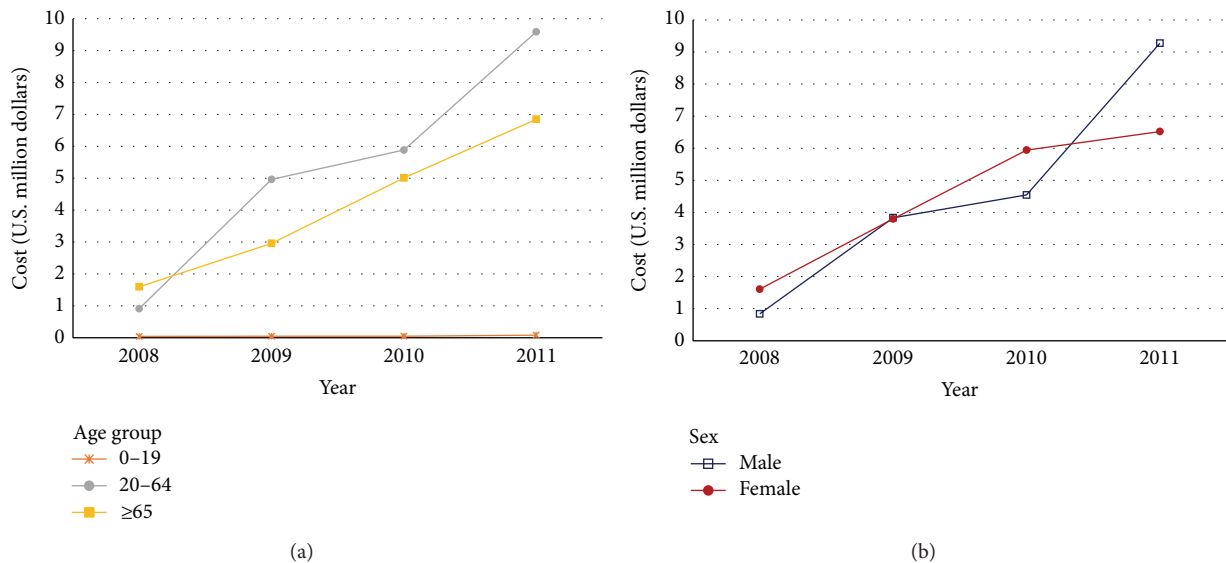
FIGURE 2: Four-year trend of total costs of Clostridium difficile infection by age group (a) and gender (b).