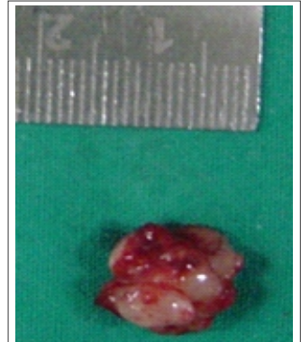
Figure 3: Grey, irregular, multilobulated soft mass measuring 12x10x6mm

excess trauma to surrounding functional spinal cord tissue [4]. The Mycobacterium TB isolated from the tuberculoma will help in deciding the AKT in the present scenario of drug resistance to AKT. AKT with four drugs HRZE having good cerebrospinal fluid penetration recommended for 12 months post-operative. We suggest a combination of surgical excision of tuberculoma along with AKT for IMT not responding to AKT for a good outcome.