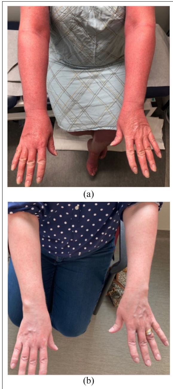
Figure 3. (a) Confluent salmon erythema of the arms with follicular papules on the knuckles. (b) Complete resolution after 3 months' therapy.

reported biologic used in PRP, supported by case reports and case series. 2,4,8,15 Given our patient's excellent response to ustekinumab, our report provides further support for the effectiveness of anti-IL12/23 agents in PRP.