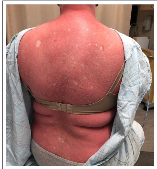
Figure 1. Confluent salmon erythema on the back with islands of sparing.

There is emerging anecdotal evidence for the use of psoriasis-type biologics, particularly ustekinumab, as off-label treatments in PRP suggesting similar cytokine profiles in the two diseases. 1,2,4,5 Recently, a group demonstrated the role of the IL-23/Th17 axis in PRP and found that levels of Th17 cytokines in patients' skin samples paralleled clinical and histological improvements during anti-IL12/23 treatment. 1 IL-17, a key proinflammatory cytokine in psoriasis, has also