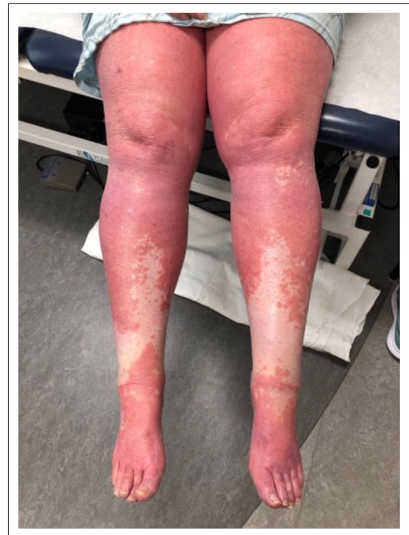
Figure 2. Symmetric confluent salmon erythema on the lower limbs with follicular papules at the active, spreading edge.

been shown to be increased in patients with PRP. 1,14 While IL-17 inhibitors have been successful in treating PRP, evidence is limited. 10,13 Ustekinumab is a more commonly