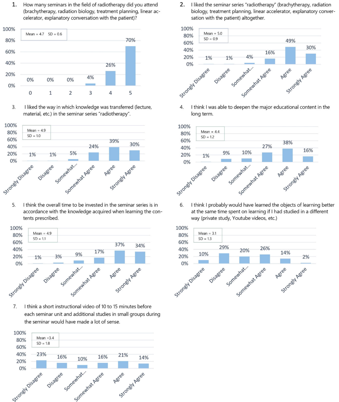
Fig. 1 Participation, acceptance, assessment of the effectiveness in terms of learning, and on a potential use of e-learning methods among medical students in connection with radiation oncology seminars