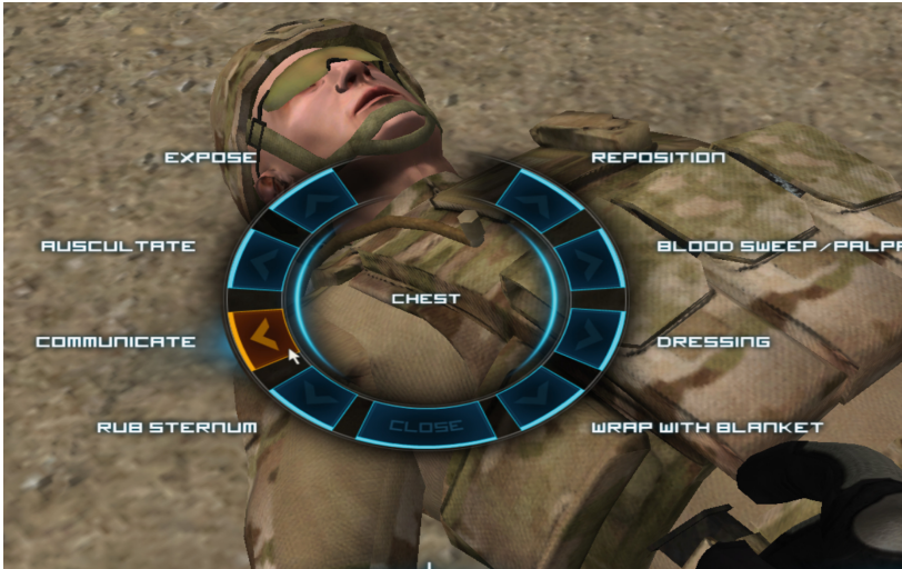
Fig. 1. TC3Sim game-based learning environment.

of Cohen's Kappa [19]. During this study, six affective states were recorded: bored , confused , engaged concentration , frustration , surprise , and anxiety , with 3,066 distinct BROMP observations captured between the two observers. During the post-processing stage, any observations for which the two observers did not agree were removed from the dataset, as were observations recorded when the students were not actually interacting with the game-based learning environment (i.e., viewing pre- and post-test material or receiving instruction on combat medic procedures). Following post-processing, there were 755 total BROMP observations captured during the study. 435 of the BROMP observations were labeled as engaged concentration , 174 as confused , 73 as bored , 32 as frustrated , 29 as surprised , and 12 as anxious . Due to the low number of observations for anxious , we do not consider instances of this affective state in this work.