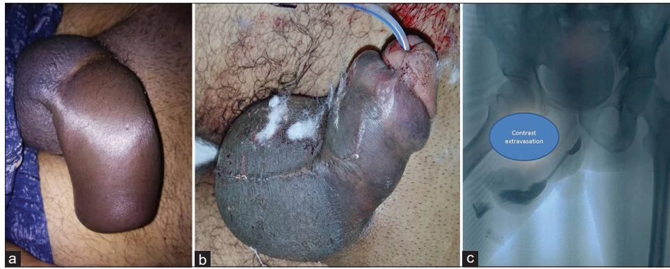
Figure 2: Fracture of penis with swelling and discoloration (aubergine sign/eggplant deformity). (a) Not associated with urethral injury. (b)- Associated with urethral injury. Patient presented with a history of blood at the meatus. Retrograde urethrogram did not show injury and the catheter was placed gently over a guidewire. (c)- Retrograde urethrogram in a patient with fracture penis showing contrast extravasation