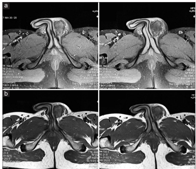
Figure 1: Magnetic resonance imaging images of a patient presenting 3 weeks after fall over an erect penis 1a: Non contrast T2 fat saturated and 1b: T1W image showing heterogeneous hyperintensity suggestive of hematoma. The defect in the left corpora is also seen

sustained the injury during masturbation. Six accidental injuries were due to rolling over the erect penis during morning tumescence. One patient was riding a motorcycle when he met with an accident and the semi-erect penis hit the handle of the motorcycle. The interval from injury to presentation ranged from 12 to 504 h. However, the majority (31/43) of the patients presented within 24 h of injury. Seventy percent (30/43) of the patients presented with an eggplant deformity [Figure 2] with diffuse ecchymosis of the penis, while 30% of the patients presented with a localized hematoma. Thirty-three (76.7%) patients reported a pop sound and a sudden detumescence of the erect penis followed by a localized hematoma or the classical egg-plant deformity. Ultrasound was performed in 27 patients and in 15/27 (55.5%) was able to delineate the tunical defect [Table 1]. The defect size was reported in 13 patients, and the mean size of the defect was 6.5 mm. Patients were explored in an emergency setting under