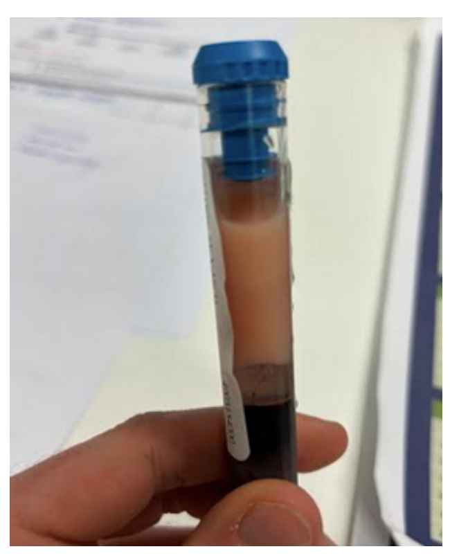
Figure 1. The blood sample of our patient. After centrifugation, the serum was highly lipemic because of severe hypertriglyceridemia (2537 mg/dl)

trials (RCT) have included few patients with pre-existing hypertriglyceridemia. The median triglyceridemia of patients included in the CLEAR Harmony Trial was 126 mg/dl<sup>[2]</sup>. In the trial of Laufs et al. , median triglyceridemia was 156.5 mg/