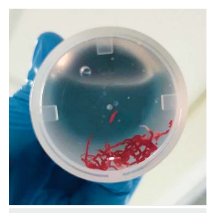
▶ Fig. 1 Specimen of a solid pancreatic mass obtained after two passes with a 22G FNB needle.

With the advent of FNB, macroscopic on-site evaluation (MOSE) of the specimen by the endosonographer has been proposed as an alternative to ROSE [23, 24]. A recent retrospective