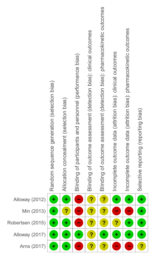
Figure 2 Risk of bias summary: review authors' judgement about the risk of bias for each included randomized controlled trial.

80% and attrition bias in 40% of the analyzed RCTs, whereas detection bias was mostly unclear.