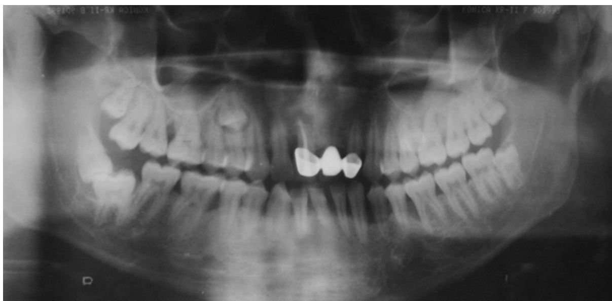
Figure 4. Post-treatment panoramic radiography showing bone fill in the vertical defects.