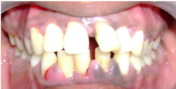
Figure 1. Initial presentation showing gingival inflammation, papillary enlargement and distolabial migration of permanent left upper central incisor.

The patient was informed about his oral condition, and a comprehensive treatment plan was presented to him. The left maxillary permanent central incisor was extracted, and full-mouth scaling and root planning were performed under local anesthesia. This procedure was supplemented with systemic antibiotic therapy consisting of amoxicillin (500 mg tid for 7 days) and metronidazole (400 mg tid for 7 days). After 6 weeks, the patient was again examined clinically; because of the persistence of periodontal lesions, he was advised to undergo flap surgery to provide access to instrumentation and regenerative therapies. Sufficient healing was achieved after the surgical management; next, a fixed partial denture made of porcelain fused to metal was fabricated and inserted in relation to teeth 11, 21, and 22. After