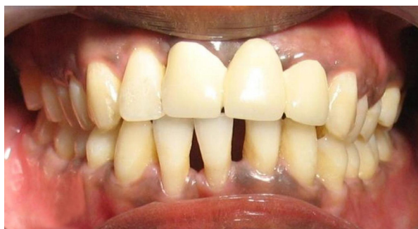
Figure 3. Clinical presentation after treatment showing gingiva in health.

Multiple supernumerary teeth are very rarely observed, and in most cases, they are associated with syndromes such as Gardner's syndrome, cleidocranial dysplasia, and cleft lip and palate. 3 Many theories have been proposed to explain the genesis of supernumerary teeth, such as the theory of atavism or phylogenetic reversion, dichotomy of the tooth bud, and hyperactivity of the dental lamina. Of these, the theory of hyperactivity of the dental lamina seems the most acceptable. The exact etiology of the occurrence of supernumerary teeth is unknown, and both environmental and genetic basis have been suggested. The ge-