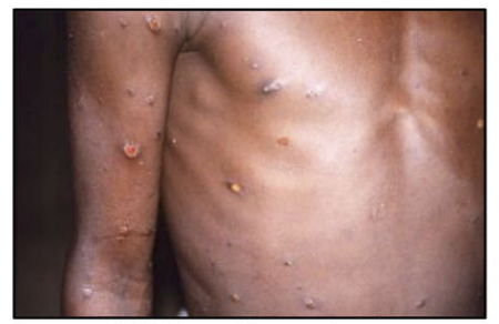
Skin lesions on right arm and torso CDC PHIL ID#: 12779