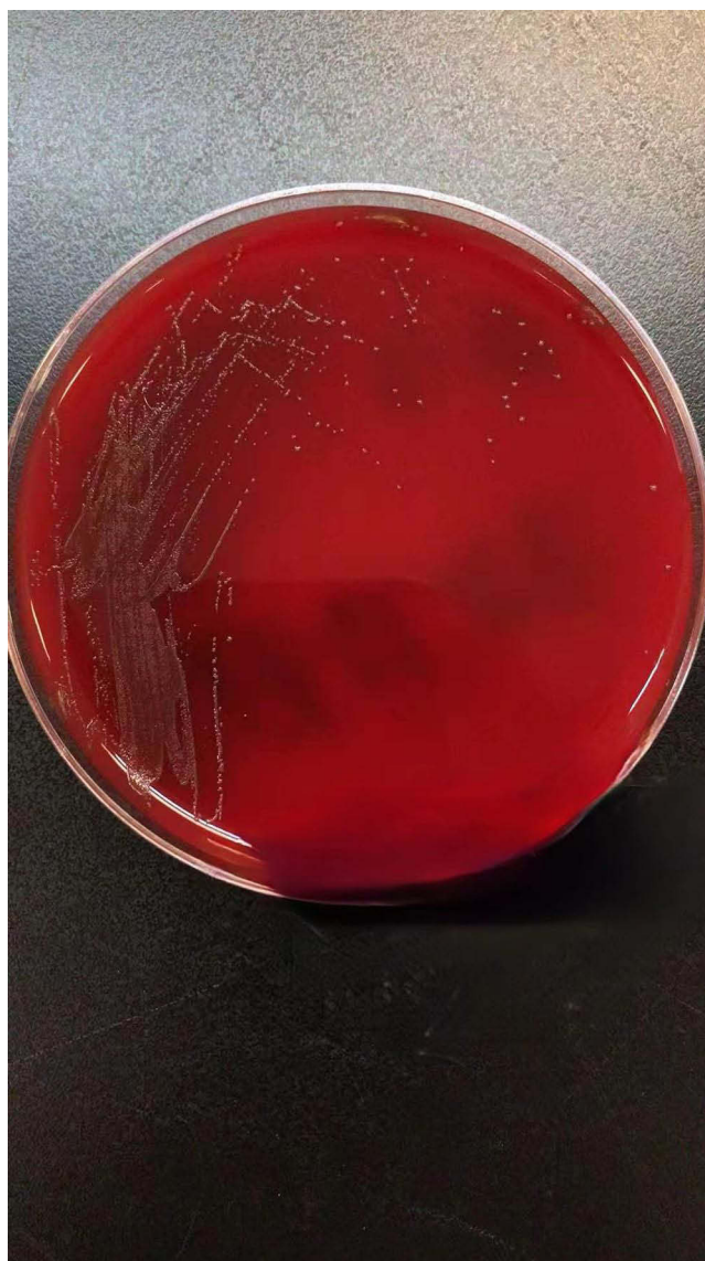
Figure 2 The colonies were medium in size, off-white in color, smooth, and rounded in shape on Columbia blood medium.

present in either ear. Methylprednisolone 80 mg qd was added for 5 days, and emicizumab 500 µg was administered intravenously once daily for symptomatic treatment. Joint ultrasound showed fluid accumulation in the left patellar bursa and a small amount of fluid in the right patellar bursa, with slightly thickened synovium in both knees. Joint effusion and