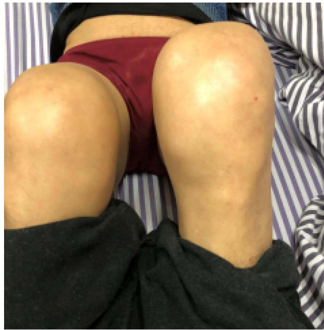
Figure 1 Swelling of both knee joints in the patient diagnosed with S. suis meningitis.

On the fourth day of admission, the patient's head still was swollen but had improved, and the knee joint soreness and limited mobility had also improved. The patient had a normal body temperature, clear consciousness, correct responses, dizziness, visual rotation, and unstable gait. Significant pain was felt upon flexing the knees, and swelling was observed in both knees. The muscle strength in both lower extremities was of grade 4, and the patient's mental state was still good. The neck resistance was positive, and Kernig's and Brudzinski's signs on both sides were negative.