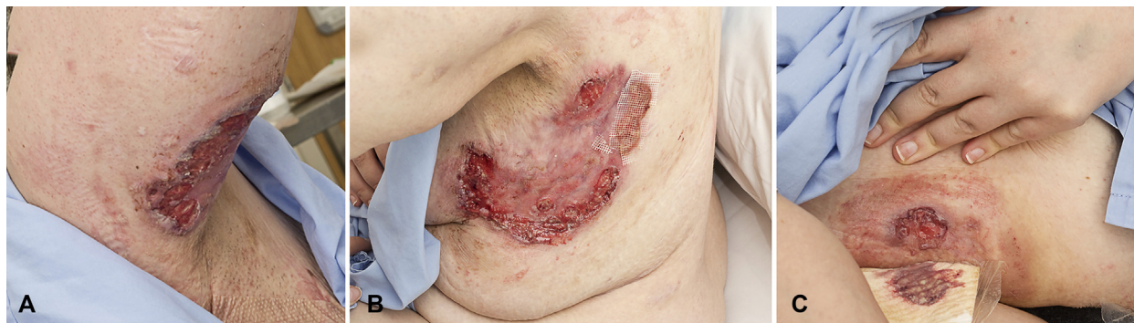
Fig 1. The patient's pyoderma gangrenosum lesions at the time of commencement of tocilizumab, involving the (A) right upper arm, (B) left lateral chest wall, and (C) right anterior abdomen.