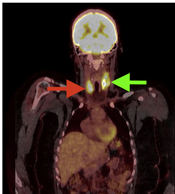
Fig 3. Positron emission tomography imaging showing increased uptake in the right common carotid artery (red arrow) corresponding to the area of stenosis and increased uptake at the site of the left common carotid artery stent (green arrow).

The patient's inflammatory markers normalized within 2 weeks of the first tocilizumab dose