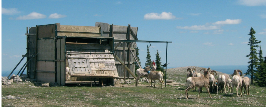
Fig 1. Corral trap baited with salt used to capture bighorn sheep at Ram Mountain, Alberta, Canada.

with salt (Figure 1; see methods and Réale et al. 2000 for details). Pedigree-based quantitative genetic analyses determined that both traits had an additive genetic basis and were negatively genetically correlated (Réale et al. 2009). The availability of detailed life history information for most individuals also provided links between personality and fitness components. For example, bold and docile ewes were found to reach sexual maturity before shy and aggressive ones (Réale et al. 2000). Boldness in ewes was also positively correlated with weaning success (Réale et al. 2000) and survival in years of high cougar ( Puma concolor ) predation (Réale and Festa-Bianchet 2003). In males, docility and boldness were found to have a positive effect on longevity, a weak negative effect on early life reproductive success, and a strong positive effect on late life reproductive success (Réale et al. 2009). Personality therefore appears to play important roles in the ecology and evolution of this species.