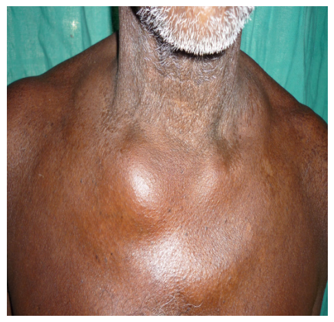
Figure 1. Patients presenting with right sternocostoclavicular joint swelling.