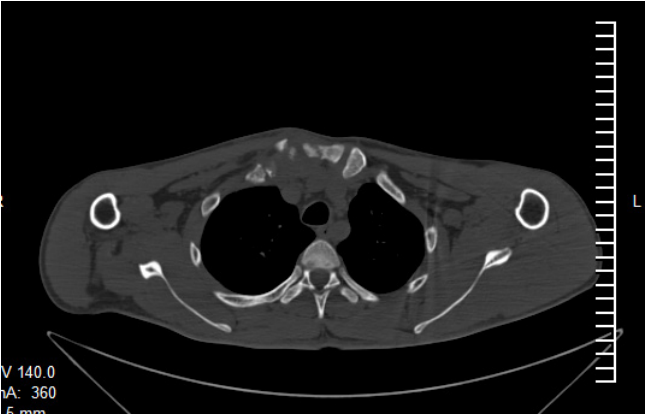
Figure 3. CT image showing features of pyogenic infection of right sternocostoclavicular joint.

Tubercular involvement of the joint was observed in three patients. Of these, two were females and one was a male child of 12 years. The child had a positive history of contact with tuberculosis from his father. The