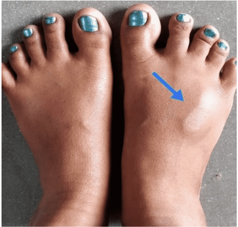
FIGURE 1: Focal swelling on the dorsum of the right foot.