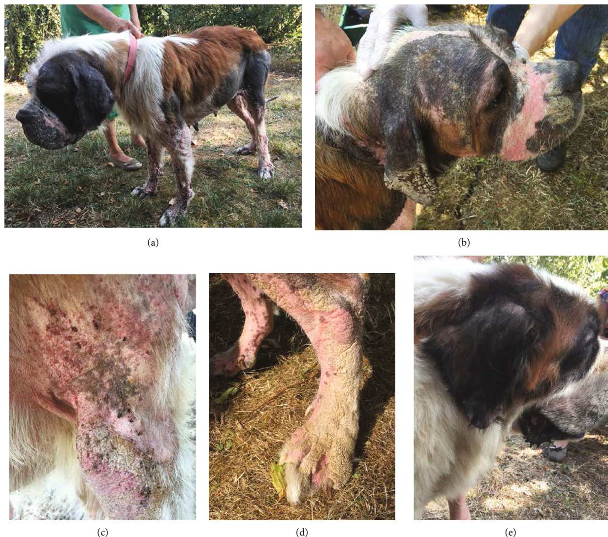
FIGURE 1: Initial physical examination. Extensive alopecia and poor body condition (a); close view of the head: alopecia, erythema, crusts, and scaling localised mainly on the convex aspect of the pinna and muzzle (b). Self-inflicted lesions associated with alopecia, papules, and thick crusts on the shoulder and elbow (c). Alopecia, erythema, and thick scaling/crusting on the distal part of a hind leg (d). Least-affected dogs only showed alopecia on the pinnae and face (e).

Two weeks later, the cutaneous score was 92.5 on average (min 37, max 146), corresponding to a decrease of 47% as compared to day 0. Skin scrapings were negative for all but three animals. Three dead adult mites were found on two dogs, and a single egg was observed on the third dog. The pruritus score was nil and subsequently remained as such.