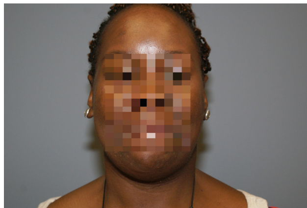
Figure 2 Patient 6 weeks postoperatively after left superficial parotidectomy. A similar result can be seen as compared to the right side. Facial contour and symmetry has been restored with excellent cosmetic outcome.

The initial studies regarding BLEC and surgery were performed in the early 1990s. Shaha et al undertook a retrospective review of 35 parotidectomies (20 superficial parotidectomies, 15 removal of the parotid tail for isolated cysts) for BLEC with up to six years of follow-up. 15 A complete response was seen in all 35 patients, although cysts did develop on the contralateral side in several patients. A study by Ferraro et al looked at surgical enucleation of 10 patients with bilateral BLEC (20