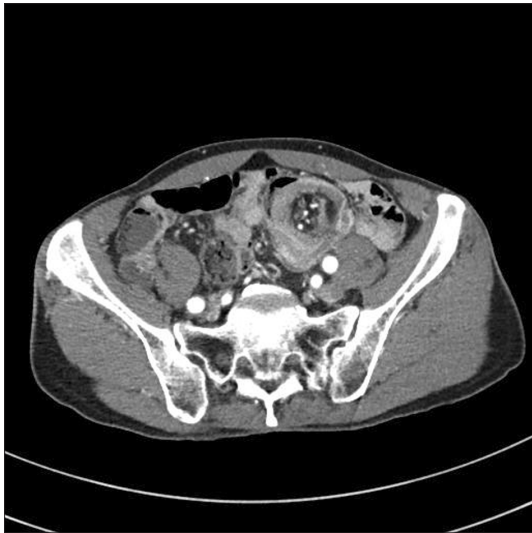
Fig. 1. CT scan showed 'a target sign' appearance confirming the diagnosis of intussusception probably due to proximal sigmoid colon cancer with mild pelvic ascites.

the left lower quadrant and suprapubic area; however, the symptom was observed to subside after pain control. Hematological laboratory examination findings were within the normal range. CT scan revealed 'a target sign' appearance confirming the diagnosis of intussusception probably due to proximal sigmoid colon cancer with mild pelvic ascites (Fig. 1). There was no evidence of enlarged lymph nodes.